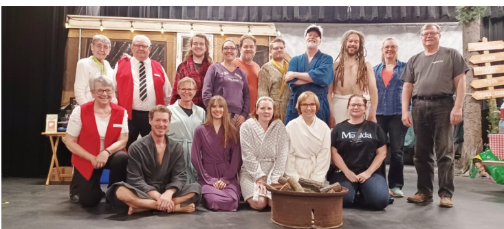
Cast, Crew, and some of the Production Team

All of the above just goes to show you some of the volunteer work that is involved with amateur theatre. HCP puts on wonderful shows but our cast of volunteers are the core of our organization.